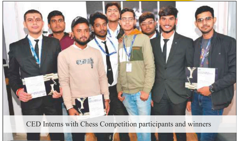
CED Interns with Chess Competition participants and winners