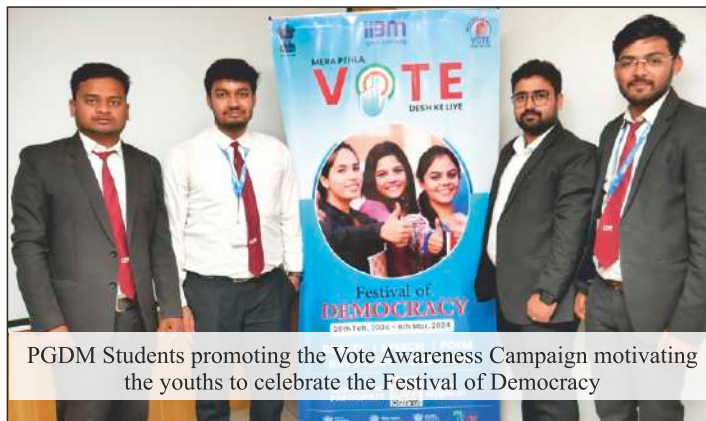
PGDM Students promoting the Vote Awareness Campaign motivating the youths to celebrate the Festival of Democracy