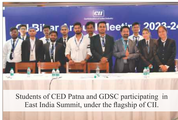
Students of CED Patna and GDSC participating in East India Summit, under the flagship of CII.