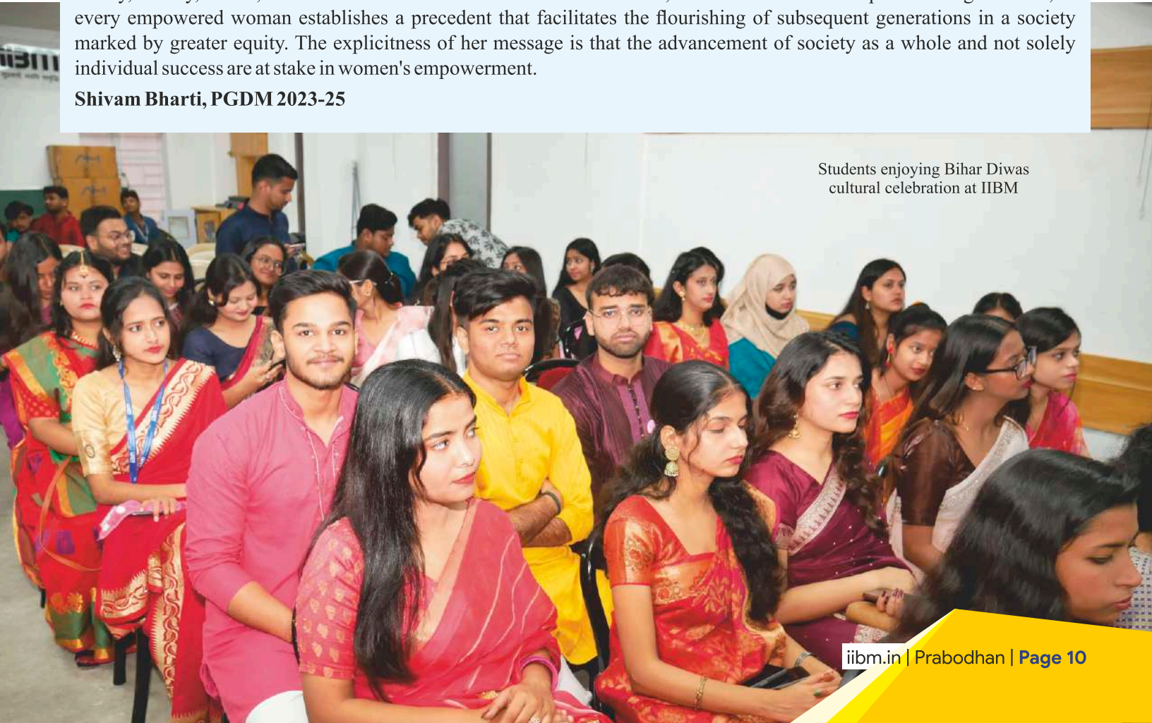
Students enjoying Bihar Diwas cultural celebration at IIBM