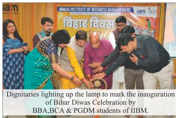
Dignitaries lighting up the lamp to mark the inauguration of Bihar Diwas Celebration by BBA,BCA & PGDM students of IIBM.