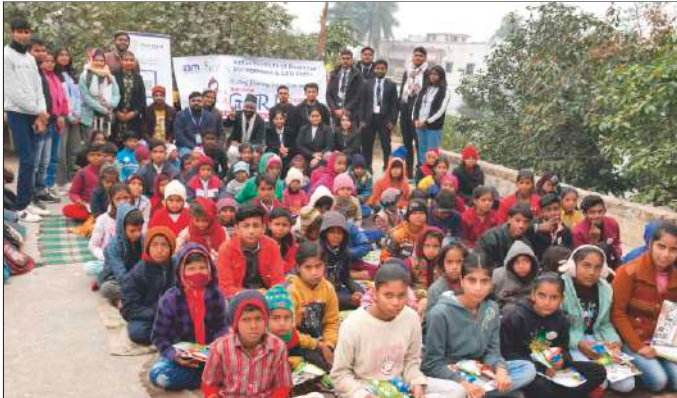
Students of CED Patna celebrating National Girl Child Day in collaboration with ALF.