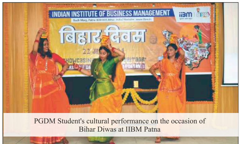
PGDM Student's cultural performance on the occasion of Bihar Diwas at IIBM Patna