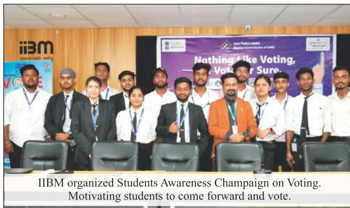
IIBM organized Students Awareness Campaign on Voting. Motivating students to come forward and vote.