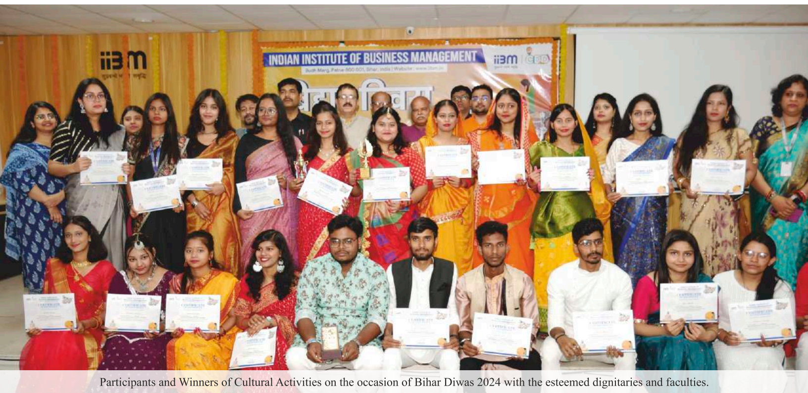
Participants and Winners of Cultural Activities on the occasion of Bihar Diwas 2024 with the esteemed dignitaries and faculties.