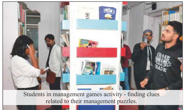
Students in management games activity - finding clues related to their management puzzles.