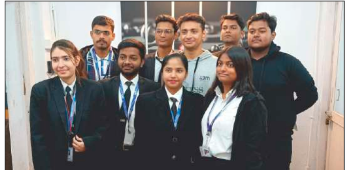
The team of IIBM CED-Patna Management and Technical Interns .