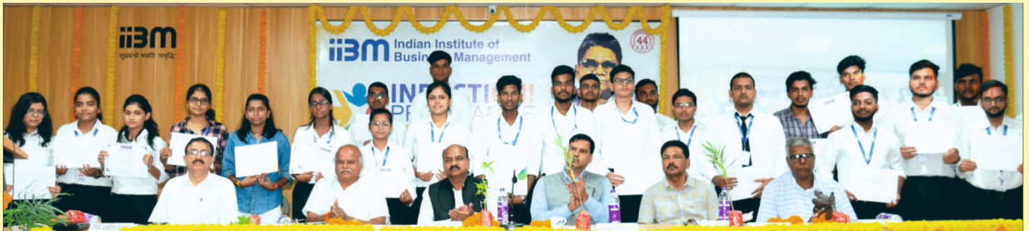
Students sharing dais with esteem panel post certificate distribution for their AWS and Cyber security course at 44th Induction program.