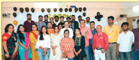
Students displaying their gratitude towards their mentor's on the occasion of Teacher's Day at IIBM Campus.