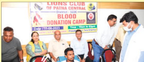
Lion's Club, Patna organized a District Blood Donation Camp at IIBM, Citizens, Staff and Students participating is the socio-voluntary activity