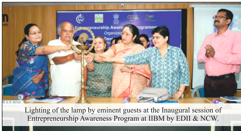
Lighting of the lamp by eminent guests at the Inaugural session of Entrepreneurship Awareness Program at IIBM by EDII & NCW.