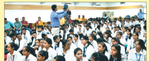
Students actively listening to the event organized by IIBM, Doordarshan and Akashvani Patna on Women Empowerment and Prevention against Sexual Harassment