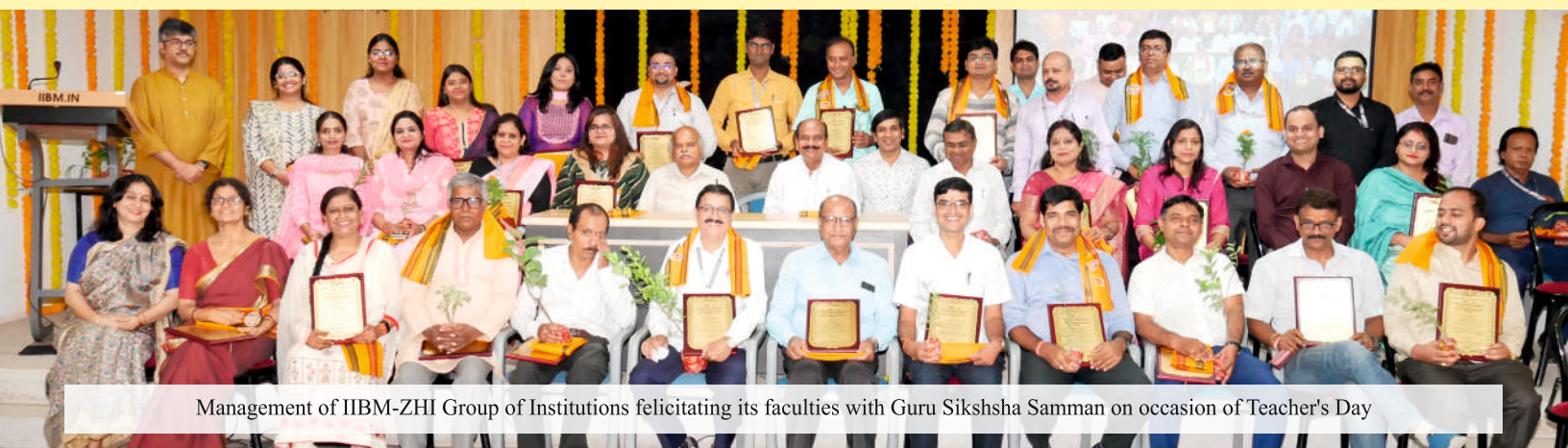
Management of IIBM-ZHI Group of Institutions felicitating its faculties with Guru Sikshsha Samman on occasion of Teacher's Day