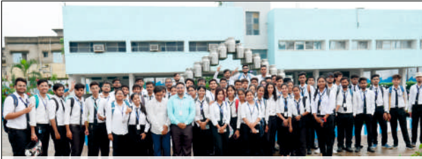
BBA (2021-2024) Students on their Academic Industrial visit to Sudha Dairy, Patna.